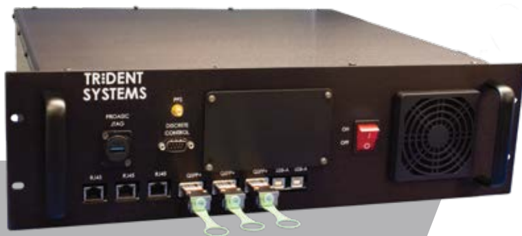
Lab Development on Trident Flight-Like Hardware

Development Kits are an integral part of Trident's Rapid Response methodology which enable our customers success on fast-paced, cost constrained, modern space programs. Demonstrated on multiple flight programs, contact us to learn how we can apply this methodology to your programs.